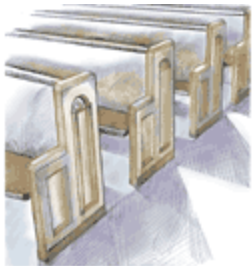
View from the Pews