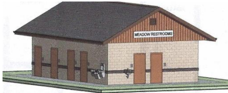
New Meadow Restrooms

A new facility to replace our current pool shower house, built in 1968, is designed for year-round use, providing comfort, accessibility for campers and retreat guests in all seasons.