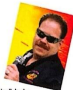
Music all day by The Sound Factory DJ Entertainment

All Cruisers eligible for People's Choice awards: ~ 1st, 2nd, and 3rd Place trophies ~ Kid's Choice trophy