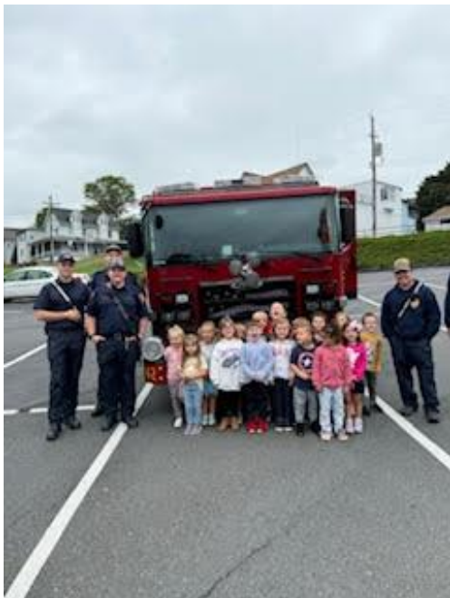
Students with local firefighters during a visit