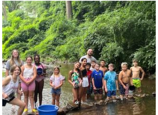
Students at the creek study.