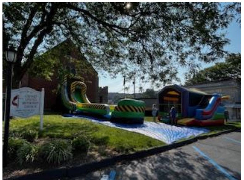
18ft water slide and moon bounce.